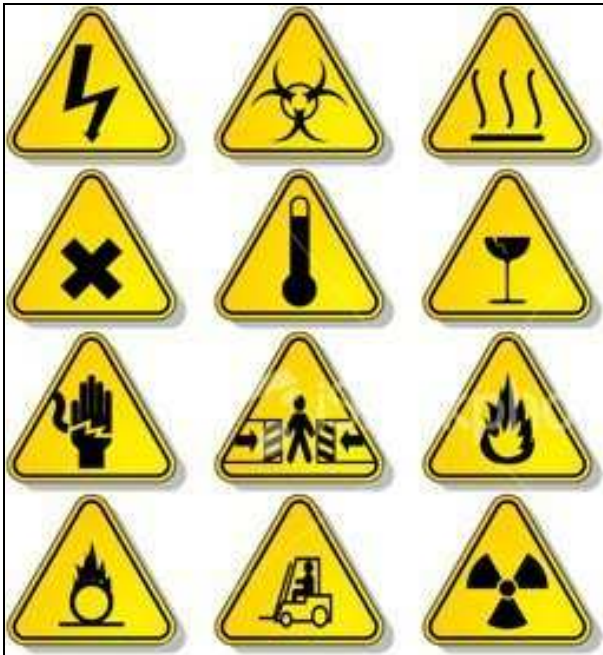
Figure 3 – Hazard signs used on nonconventional technologies machines

When risks could not be eliminated in the machine design process, the machine manufacturer must apply on the machine a hazard sign for every risk. In fig. no. 3 are presented the most common hazard signs placed on nonconventional technologies machines.