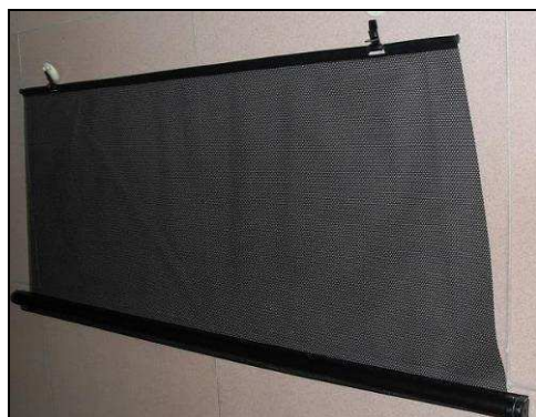
Figure 2. – PVC sunshade

In order to present these principles applied on a nonconventional technologic process, we studied OHS principles for high frequency plastic welding as an operation in window sunshade (fig. 2) production for automotive industry. The HF welding machine is designed for 4 working stations, two on each side of HF welding device and has a shuttle tray.